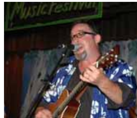
Noel in action at the Murraylands Music Festival

The Board, South Australian Council for Country Music